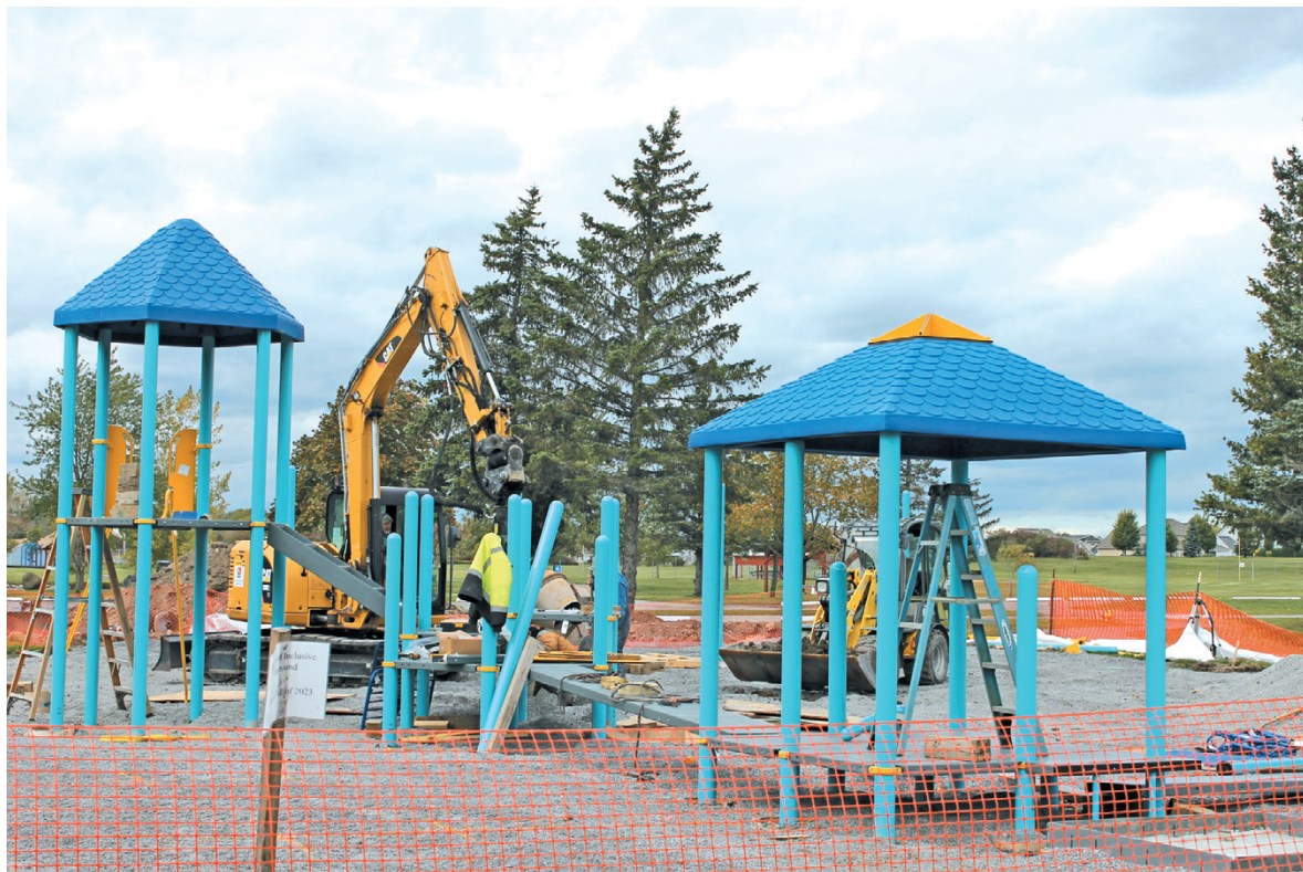
Workers with Gardenville Landscaping of West Seneca assemble the components of the inclusive playground being built in Fairmount Park, Wheatfield.